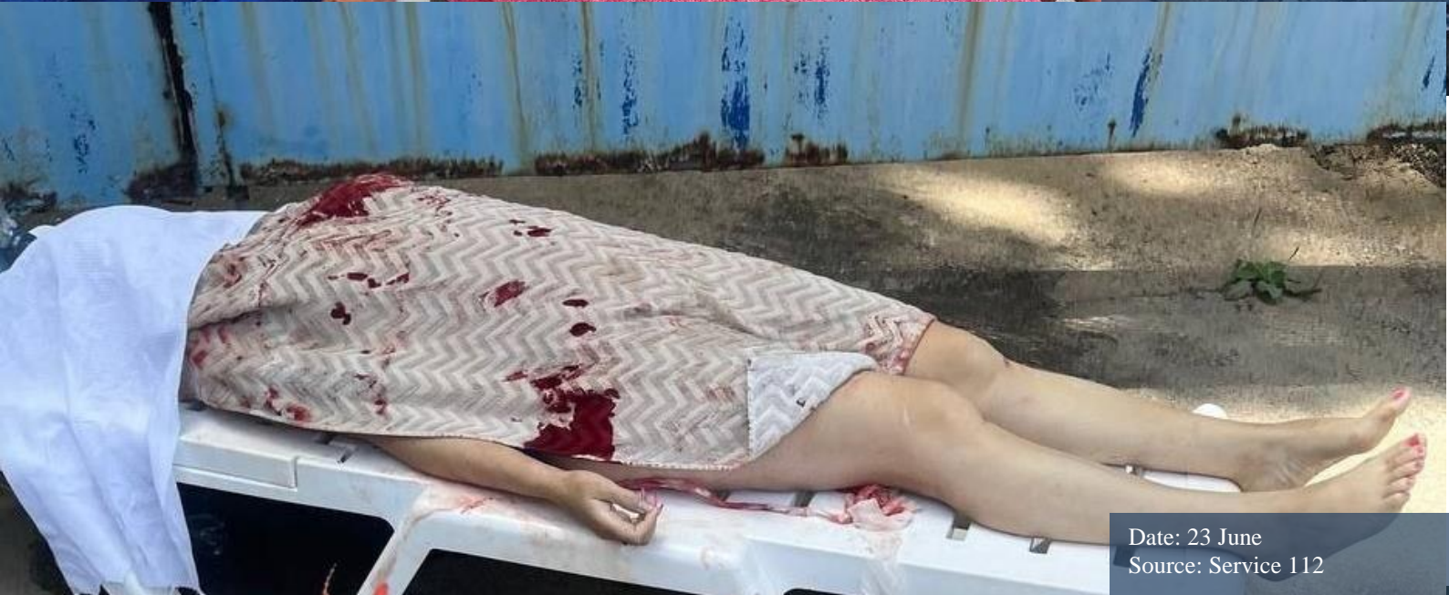
Date: 23 June