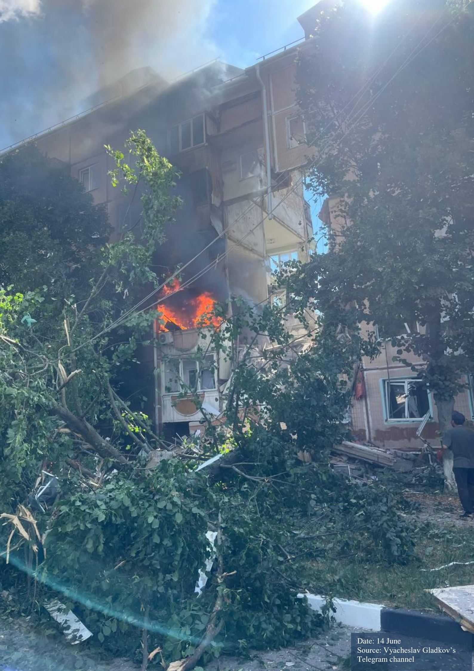
Date: 14 June