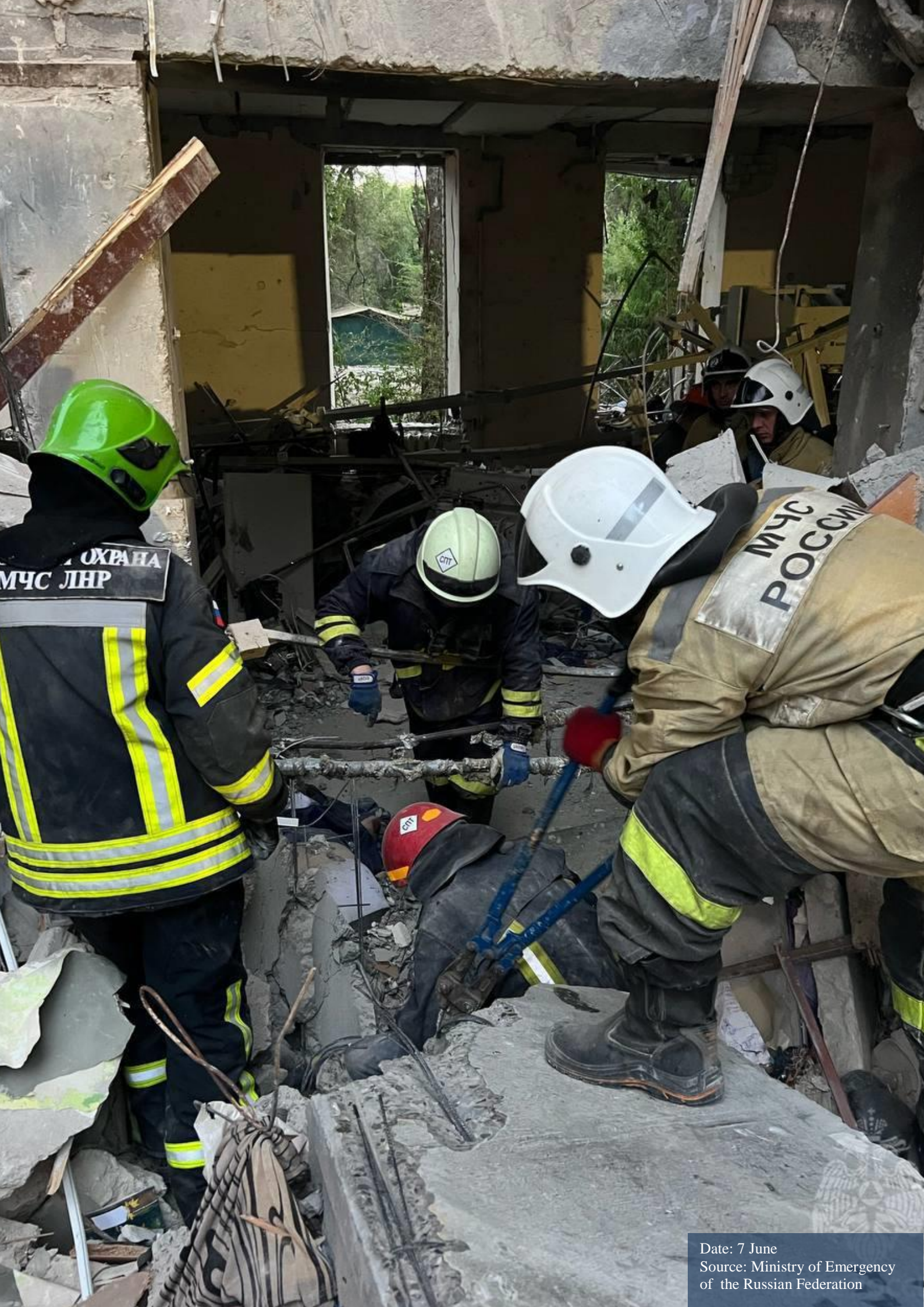
Date: 7 June