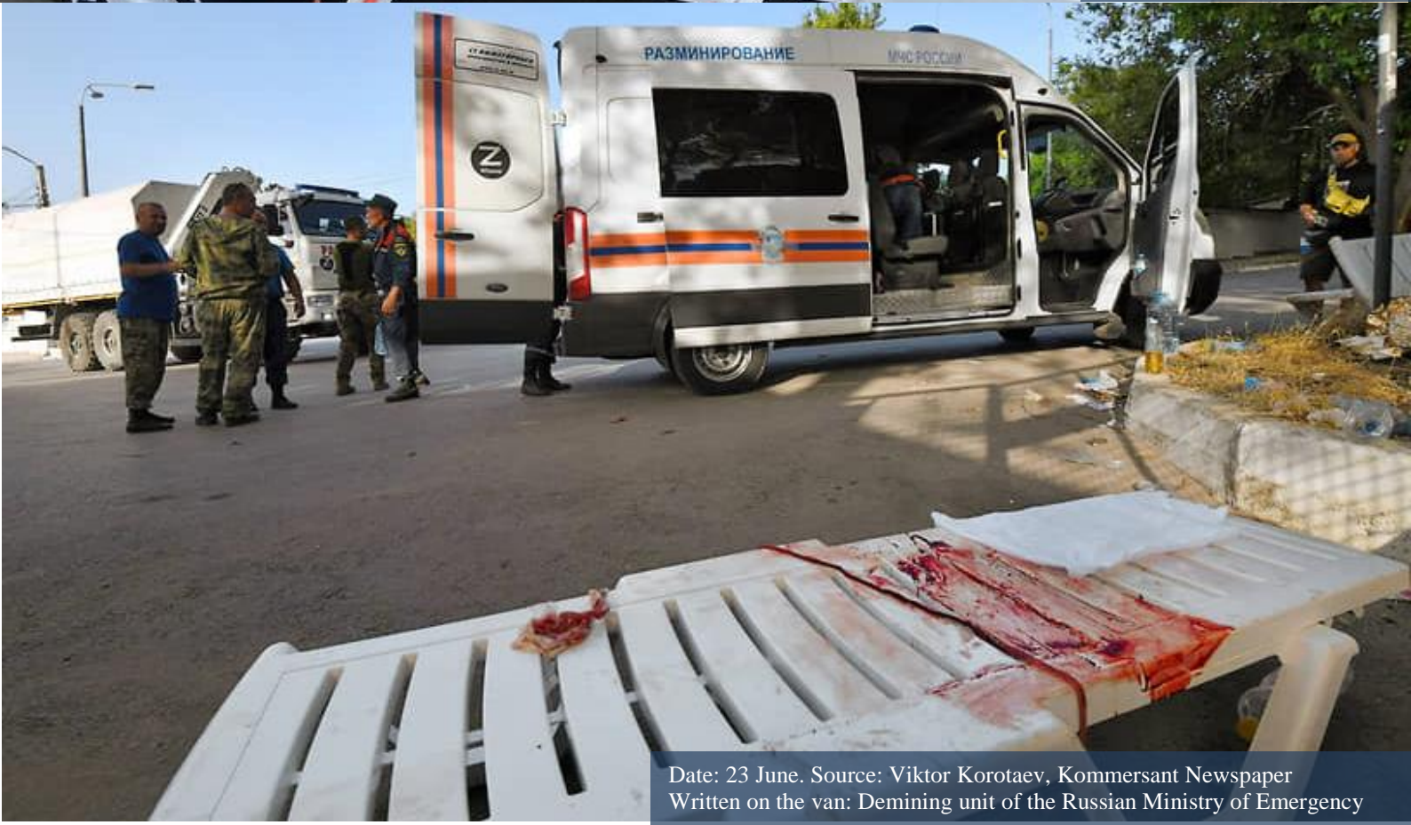
Date: 23 June. Written on the van: Demining unit of the Russian Ministry of Emergency