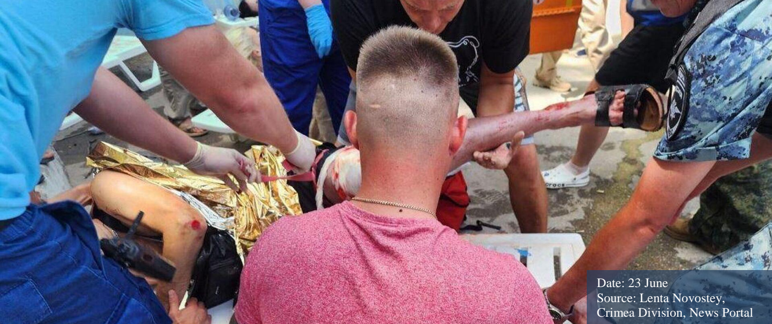
Date: 23 June Source: Lenta Novostey, Crimea Division, News Portal